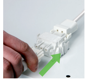
Connect the cable sets.