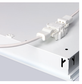
Assembly is ready.