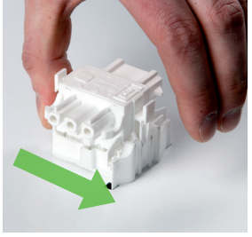
Slide the T-block toward the rectangular recess until it stops.