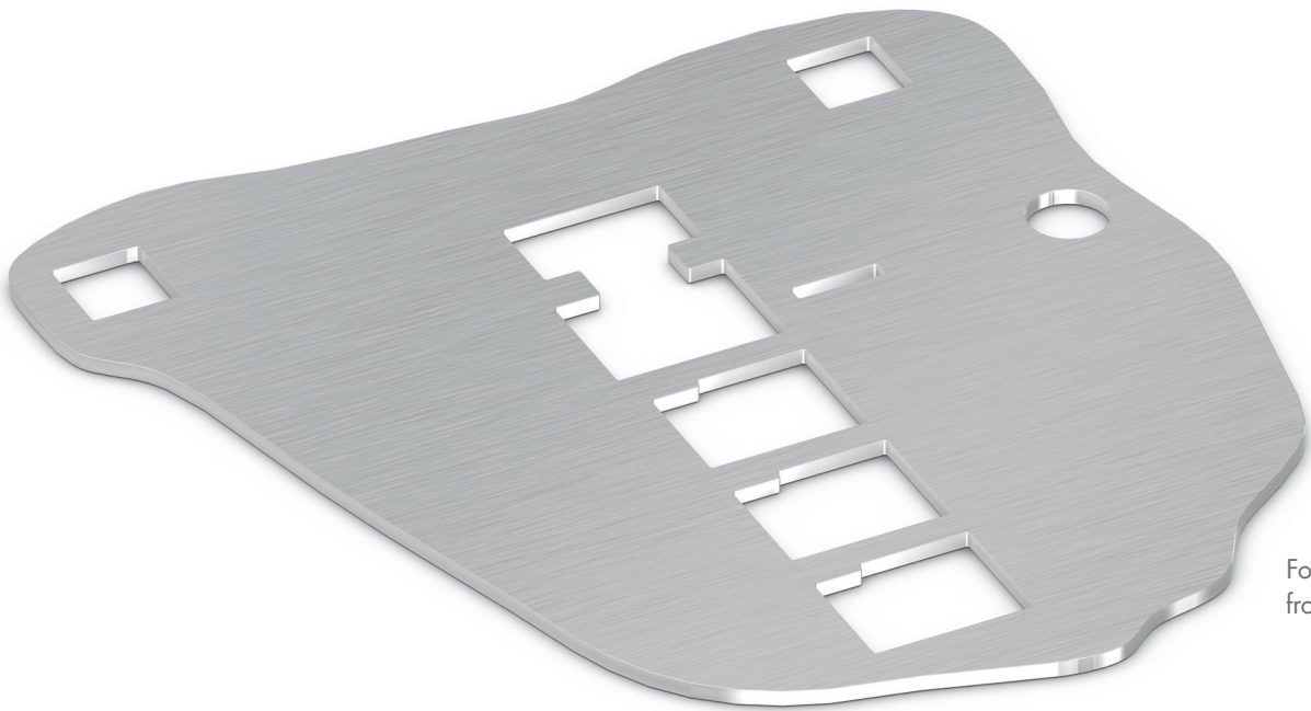
For sheet thickness ranging from 0.4 to 1.0 mm